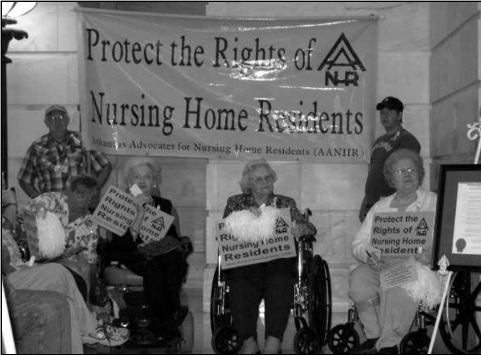
Lonoke Nursing Home Residents