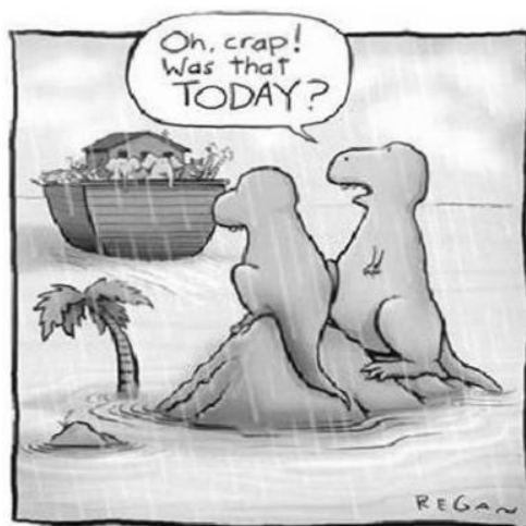
How Dinosaurs became extinct. The very first "senior moment"